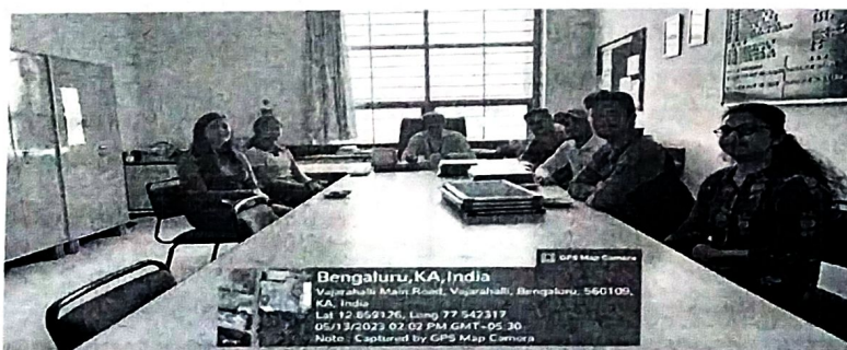
Fig1: Alumni of 2018-2022 Batch

Here are few glimpses of such interactions that happened recently