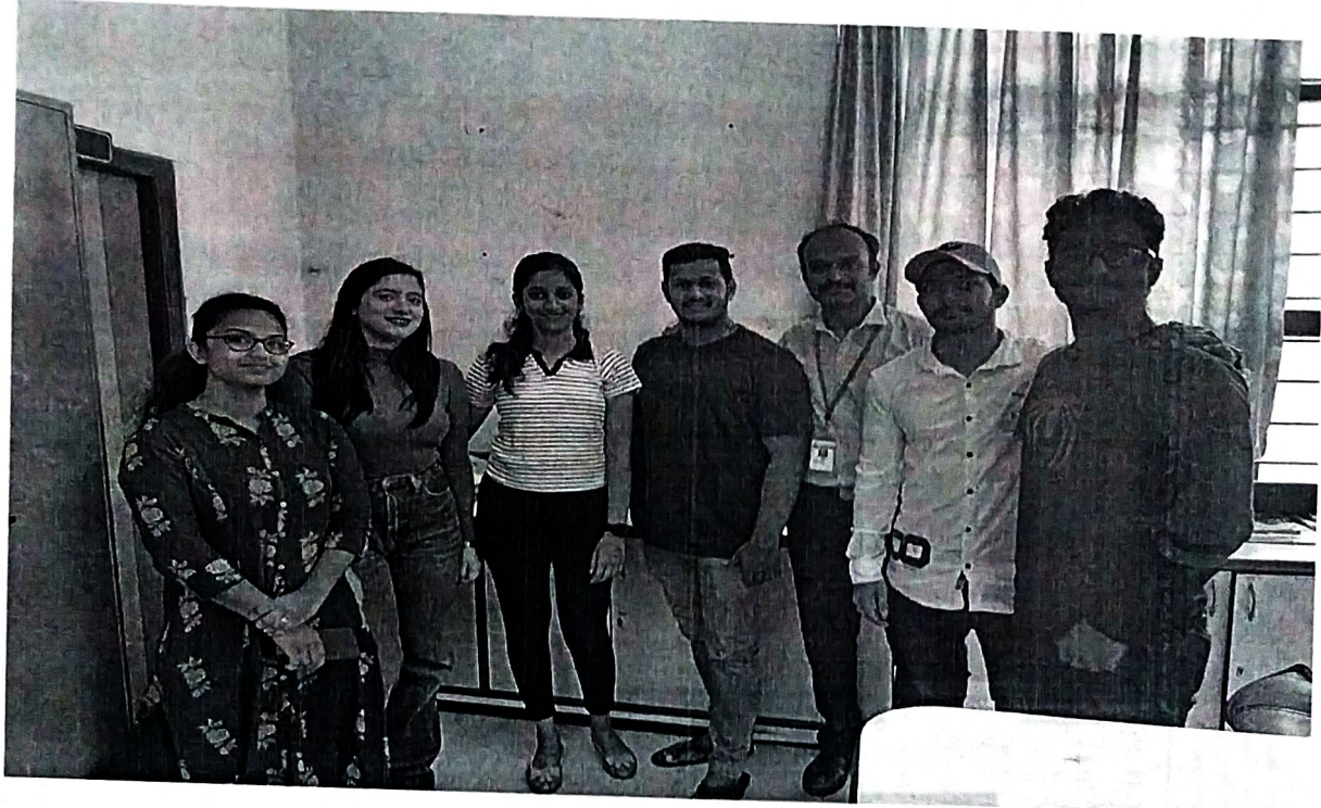
Fig 3 : Alumni of 2017-2021 Batch