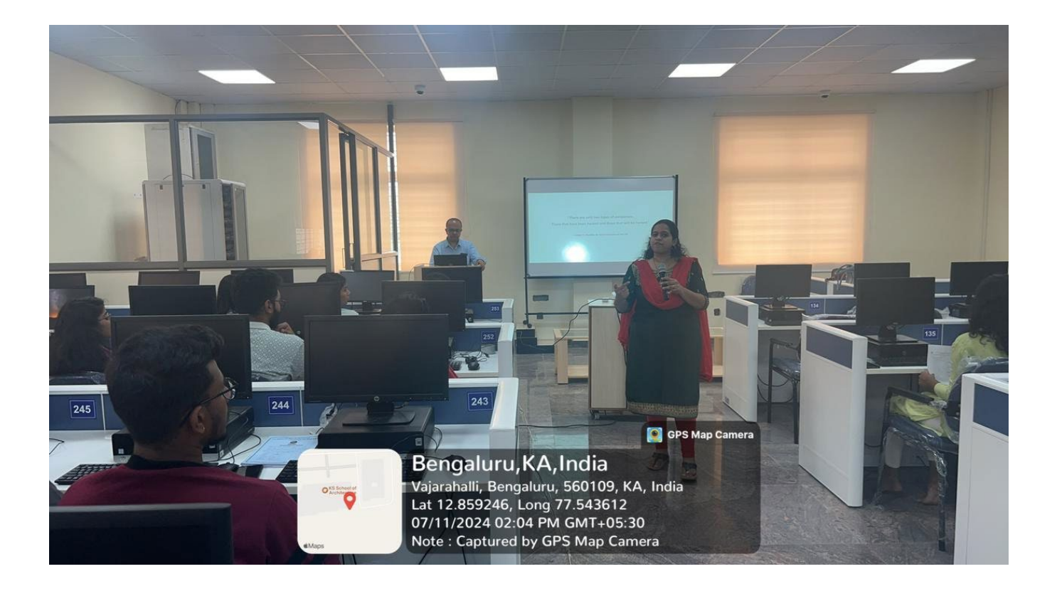
HOD Dept. of Artificial Intelligence & Data Scient, K.S. School of Engineering & Management Bangalore - 560 109.