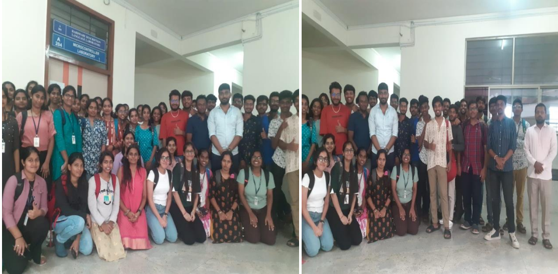
Fig 3. Guest Speaker, Faculty members and Students present in the Event

DEPARTMENT OF ELECTRONICS AND COMMUNICATION ENGINEERING