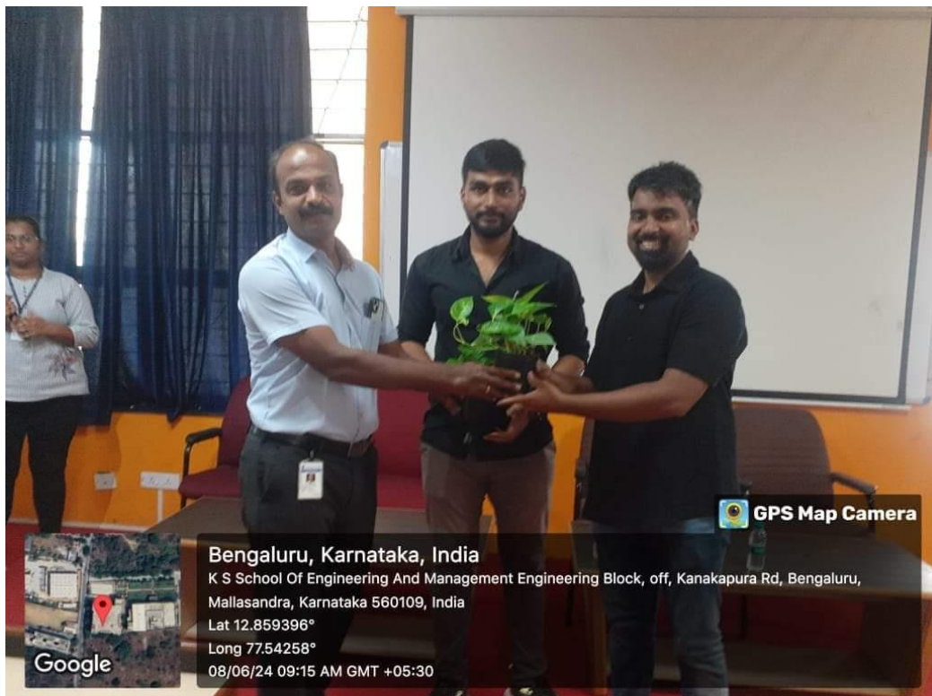
Fig 1. Inauguration of Hands on training on interfacing of sensors

Line Follower Project: One of the highlight projects was the Line Follower Robot. Participants were tasked with designing and programming a robot capable of autonomously following a predefined path using infrared (IR) sensors. The project encompassed sensor calibration, PID (Proportional-Integral-Derivative) control algorithm implementation, and real-world testing. Through this project, attendees gained insights into robot navigation, sensor fusion, and algorithm optimization.