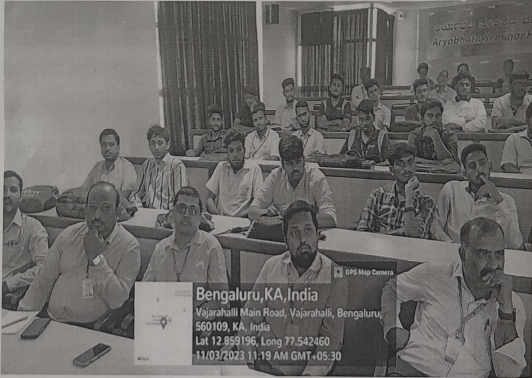
Fig 2: Faculties and 7 th SEM students who were present in the event

DEPARTMENT OF ELECTRONICS AND COMMUNICATION ENGINEERING