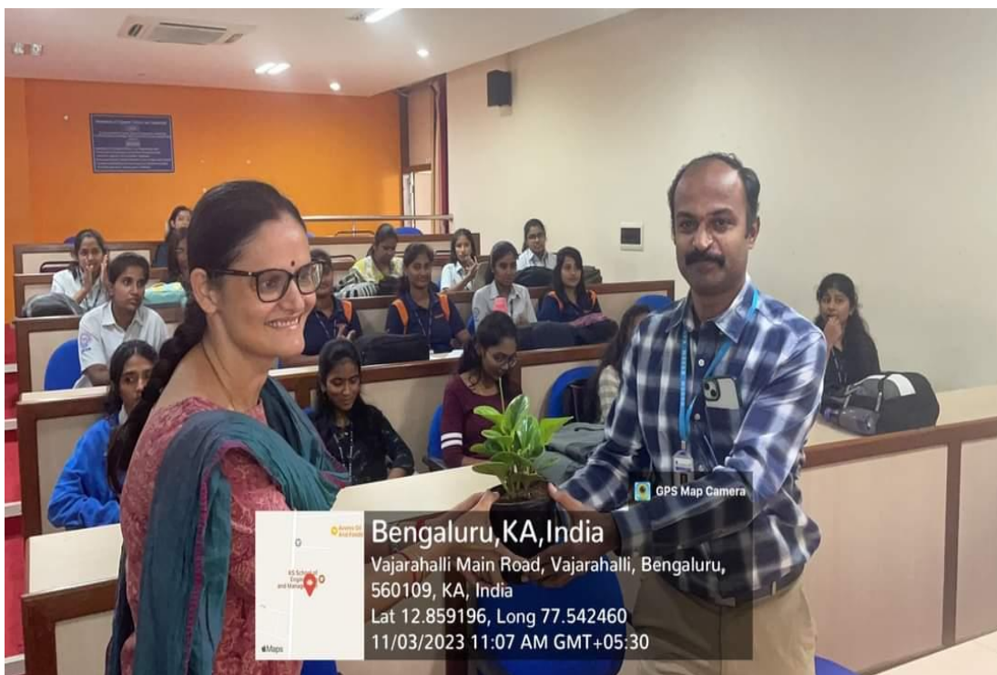
Fig 1: Inauguration of Event

The type of gas the sensor could detect depends on the sensing material present inside the sensor. Normally these sensors are available as modules with comparators as shown above. These comparators can be set for a particular threshold value of gas concentration. When the concentration of the gas exceeds this threshold the digital pin goes high. The analog pin can be used to measure the concentration of the gas.