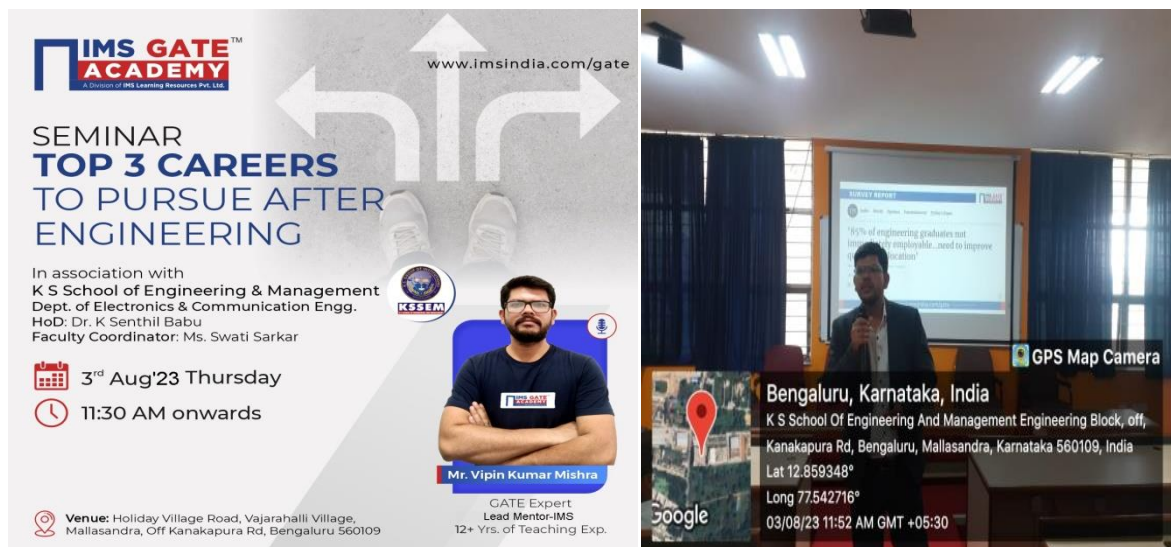
Fig 1. Guest Speaker addressing the event

This talk highlighted the student's main aim of qualifying the GATE exam to secure a government job, preferably in a PSU. It explored the comparison of GATE with JEE Mains and Advance, higher education at NITIE Mumbai, the availability of a fellowship program in management through GATE, possibilities of education abroad, and their consideration of IMS GATE Academy coaching. The report provides an overview of the student's aspirations and efforts to achieve their career goals through GATE