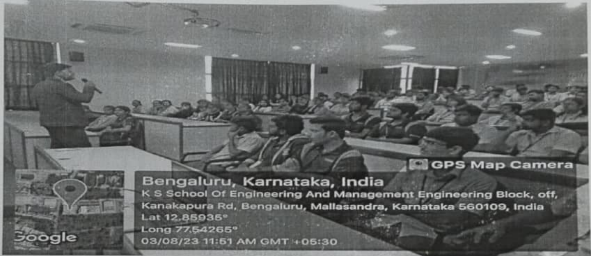
Fig 2. Guest Speaker and Students present in the Event

DEPARTMENT OF ELECTRONICS AND COMMUNICATION ENGINEERING