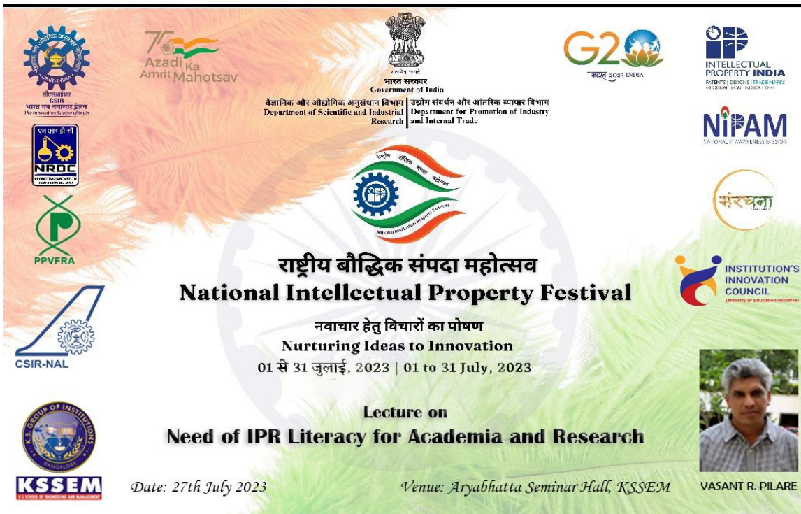
Fig 1: Event Poster