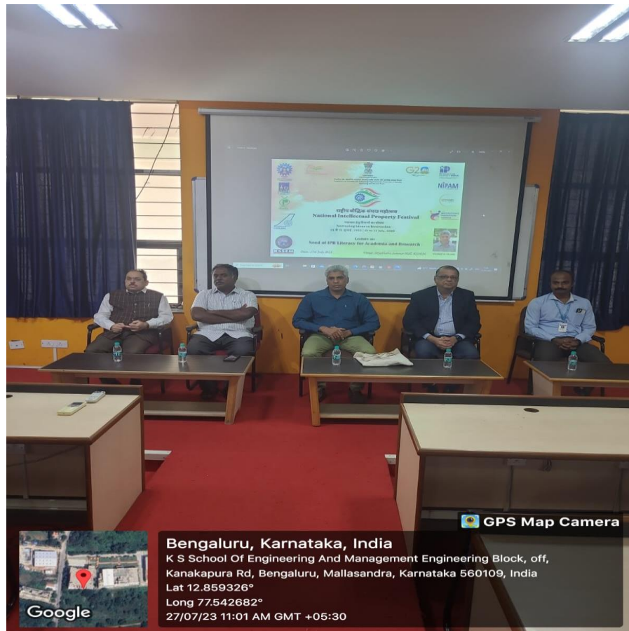
Fig 2: Event Inauguration