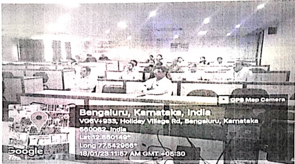
Fig: HoDs and Faculties of various departments

DEPARTMENT OF ELECTRONICS AND COMMUNICATION ENGINEERING